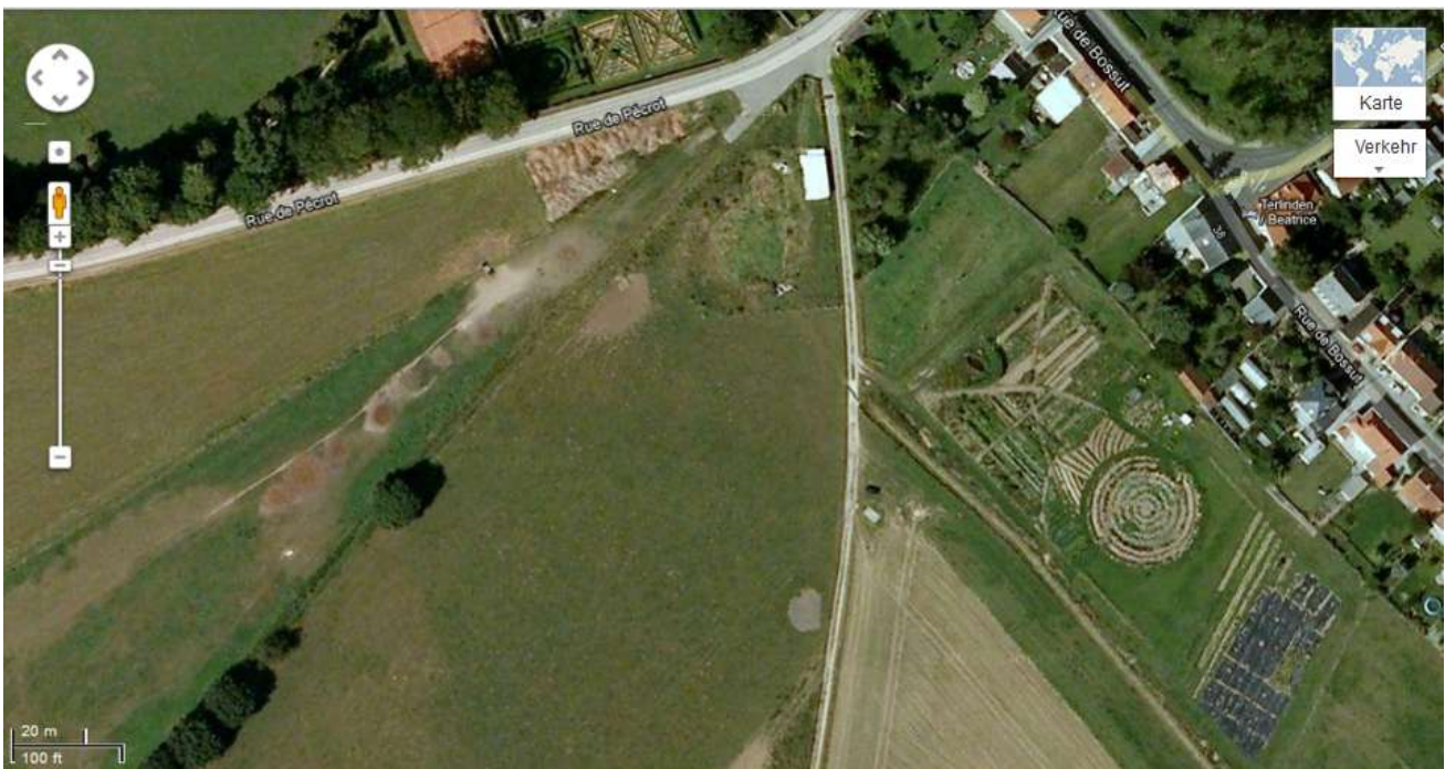
Googlemaps, left/centre area of EUPC and right the "grains de vie" garden