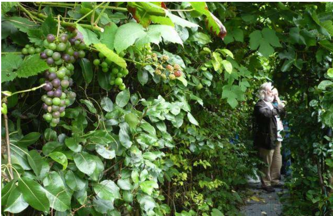
garden of the Fraternités ouvrières, Mouscron