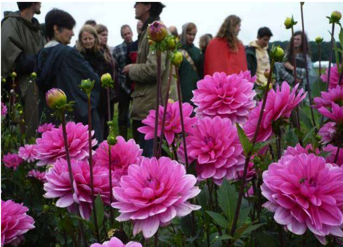
graines de vie garden, Nethen

We thank the host, the organising team, the helping hands of EUPC10 n 2010 in Grez Doiceau, Nethen, Belgium for their hospitality and the work for the organization.