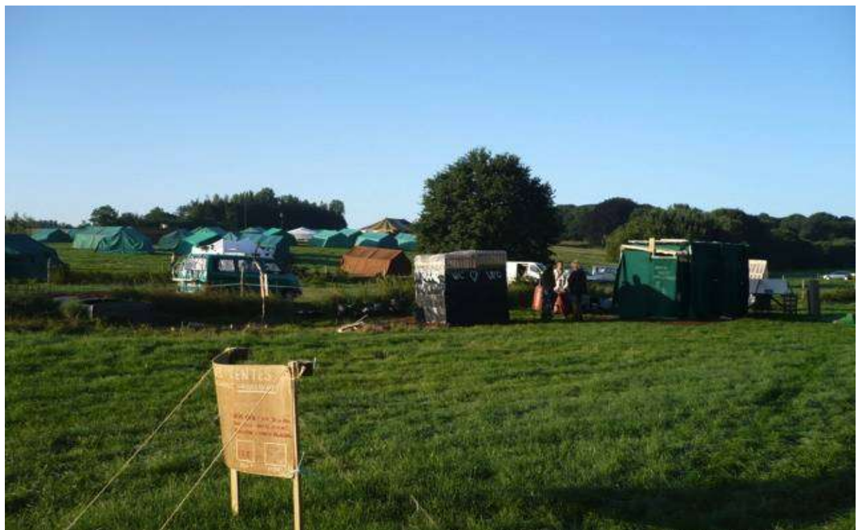
site of the festival

evening : election of the council evaluation of the event